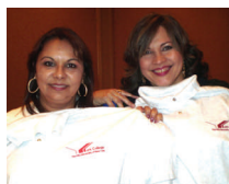
Two conference participants with their York shirts