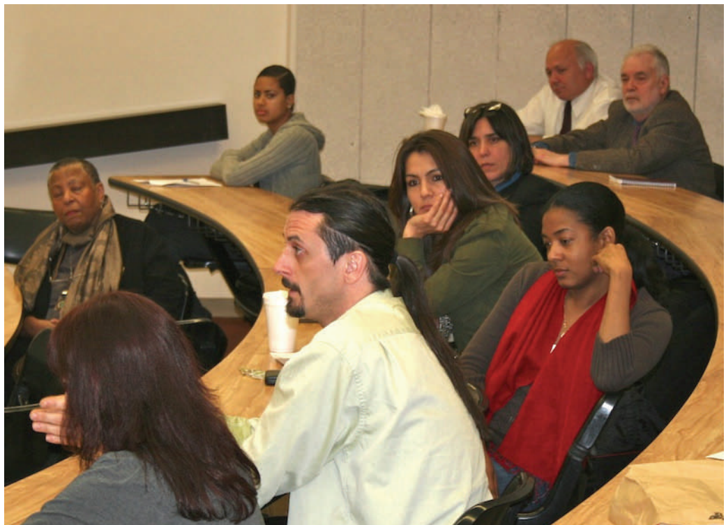
York faculty and students in discussion at the Provost Lecture on Math Education.