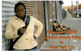
Screen capture from “NYC, Home of the Homeless”