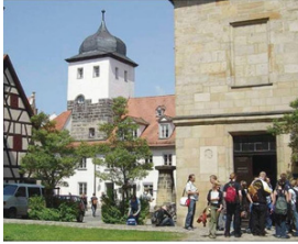
University of Bamberg campus