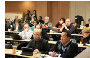
Many faculty colleagues attended the workshop