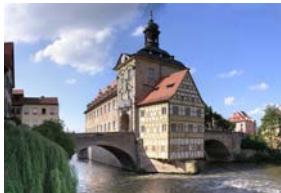
Old Town Hall, Bamberg