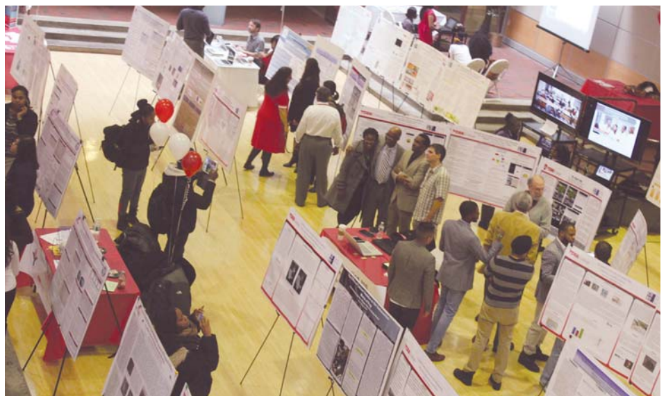
Students, faculty and guests appreciating the presentations

“These applications allow people to communicate over their devices to exchange files, messages, pictures etc. when they are in the same general area,” Dr. Jain explained. “For example, at a ball game or a concert, people may take pictures of the event and share them with each other. [In] that way people get to enjoy more of the event rather than scrambling to capture images.”