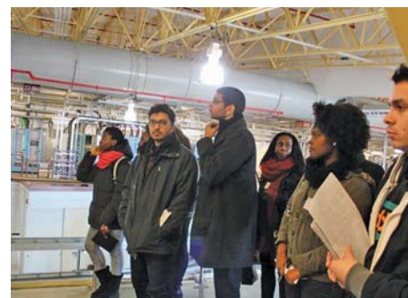
Students mesmerized by the scope of the facilities at Brookhaven National Lab

“We are driven to explore the fundamental aspects of these materials that will make them broadly applicable,” said