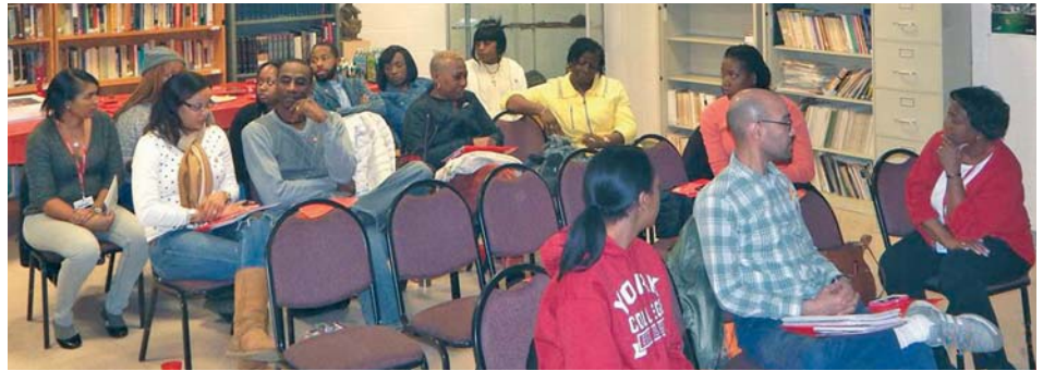
Social Work Alumni, Social Work Supervisor and Social Research II Student Scholars

mative and appreciated the opportunity to process each section of the video with attendees. Social work educators reported that they found the training especially relevant, because it informed their practice, scholarship and accountability to their nationally recognized, accrediting body—Council on Social Work Education (CSWE)—to help students master core competencies, pass the NYS Social Work License examination and emerge as leaders to meet the demands and social issues of the 21st Century.