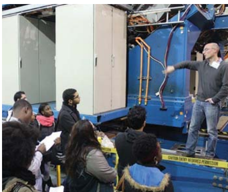
Brookhaven Scientist explains the processes to York students and faculty members

summer research experience programs, where I mentor them on a project in collaboration with a BNL scientist.”